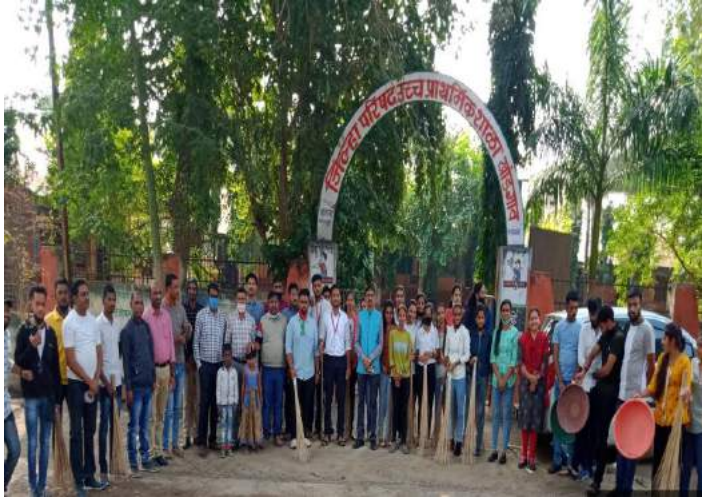
← Gram Swachhata Abhiyan at Adopted Village Khandgaon